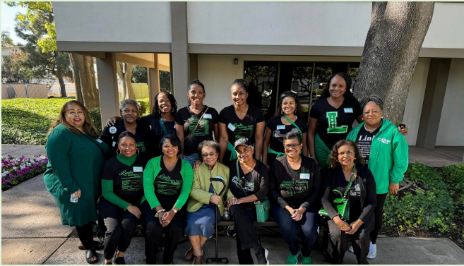
Sorting and donating clothes for "Dress for Success"