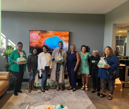
Creating appreciation respite baskets with Girls Scouts for community caregivers. Presentation given to our mentees on the importance of nurturing our caregivers.