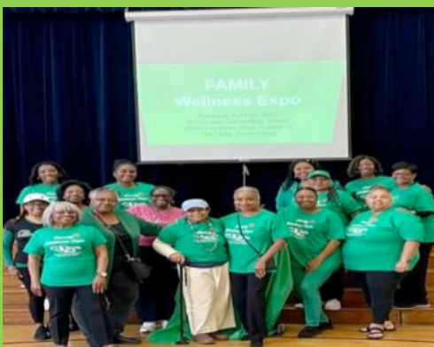
Hosting health fair for "Black Family Health Expo" for the community at Burckhalter School